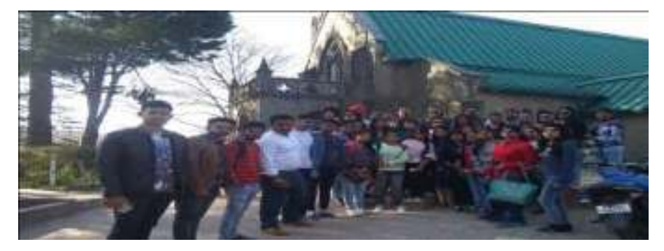
Faculty members along with students during