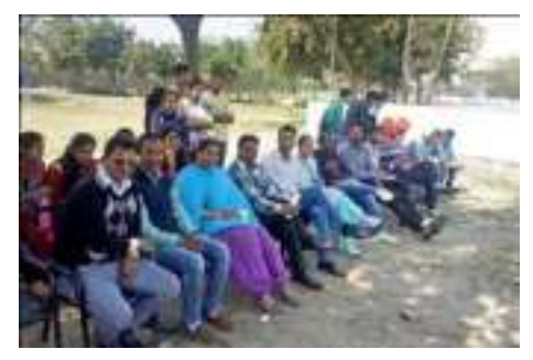
Faculty members along with students during the

• Students participating in Cricket Match match