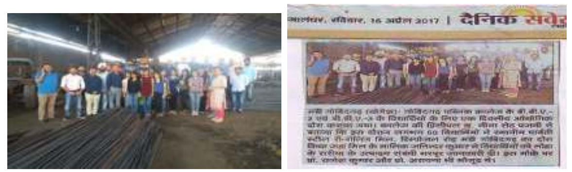
Students and teachers during the Industrial Visit at Parvati Steel Re.-Rolling Mill, Mandi Gonindgarh