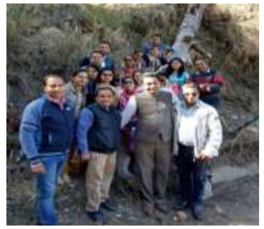
Faculty members during the Tour to Kasauli