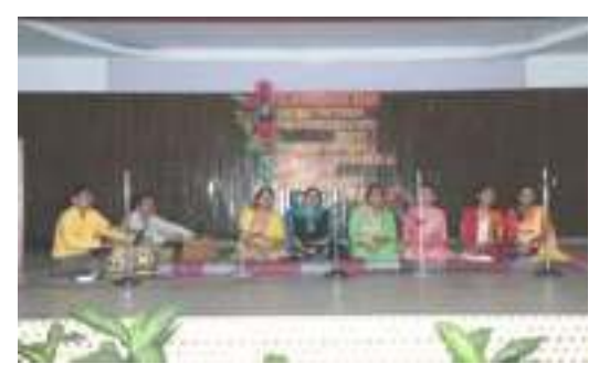
Teachers of GPC presenting song on the occasion

5-Sept.- 2016 : GESWT celebrated the Teacher's Day on 5<sup>th</sup> September, 2016 at Kanhaya Lal Bardeja Hall, GPS. Teachers from four institutes presented their talent and all teachers were felicitated by the Trust with gifts followed by Lunch.