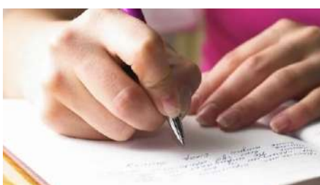
Certificate Course in Creative Writing