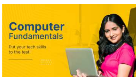
Computer Fundamentals and Office Automation