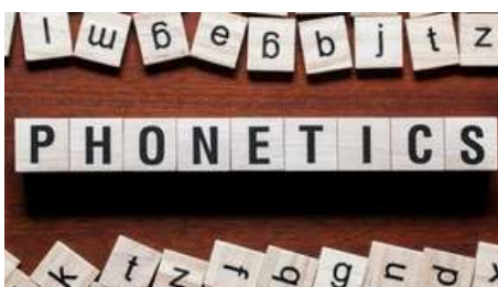
Certificate Course in Phonetics