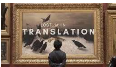
The Magical Art of Translation