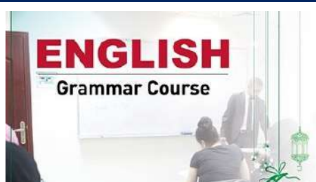
Certificate Course in Grammar