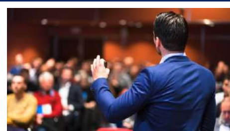
Certificate Course in Public Speaking