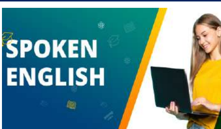
Certificate Course in Spoken English