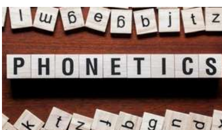
Certificate Course in Phonetics