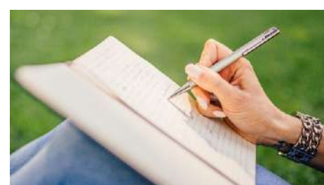
Certificate Course in Poem Writing