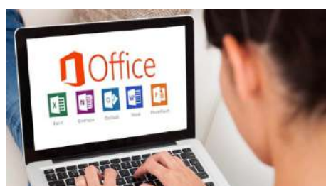
Crash Course in MS-Office and Typing Skills