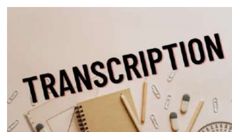
Crash Course in Transcription