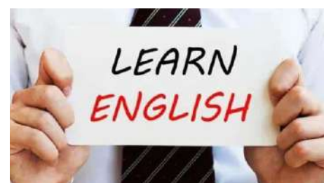
Fundamental of English (Speaking and Writing)