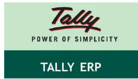
Computerized Financial Accounting Course (Tally ERP)